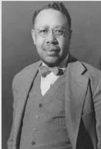
Figure 9. William Augustus Hinton, MD (15 Dec 1883- 10 Aug 1959).