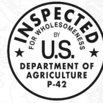
Figure 17. USDA poultry inspection stamp. (P-42 is a poultry processing plant number).