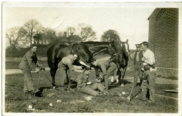
Postcard photo of soldiers and horses during World War I, dated 1915.