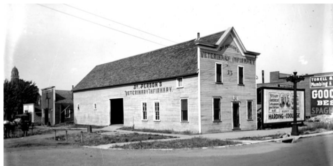
Green Acre Animal Clinic, Wahoo, Nebraska, was established in the 1890's.