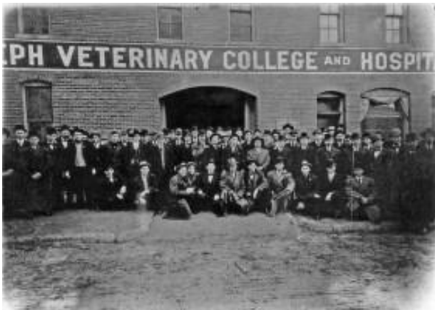
St. Joseph Veterinary College and Hospital