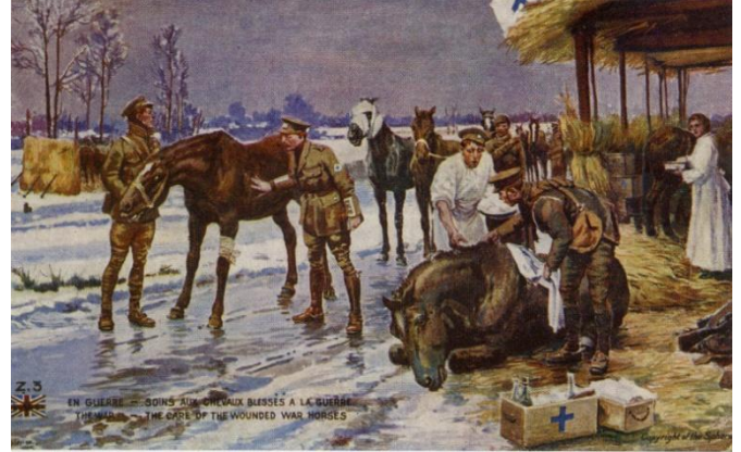
World War I postcard issued by The Blue Cross society in England to raise money for veterinary supplies for horses and mules, about 1916. Note the Blue Cross on a box in the lower right.