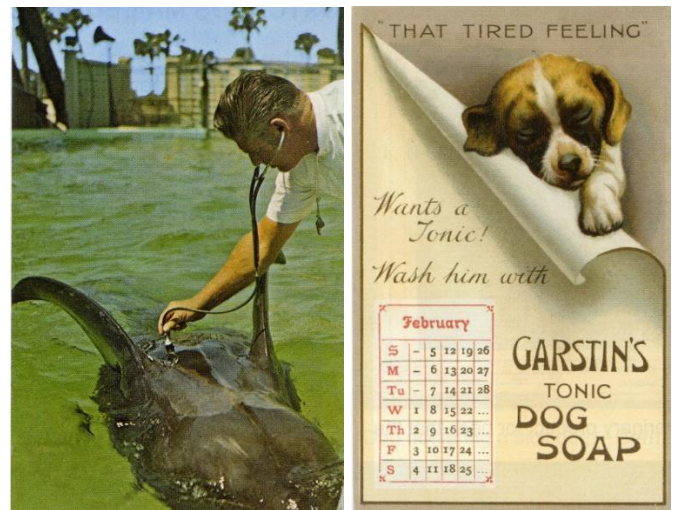
Examining an aquatic mammal at Marineland, about 1950; Dog soap advertising postcard from England, about 1915.